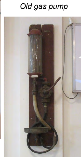
Old gas pump