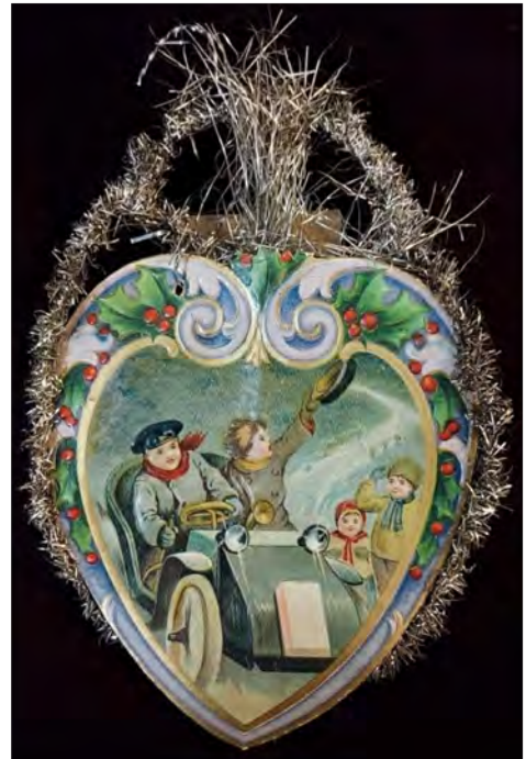
Another great Christmas decoration made from a postcard. Circa 1902, from my collection.

This item was possibly home-made using a Victorian "scrap", possibly cut from a greeting card. It's typical of many home-made decorations from the early 1900s before commercialization of the Christmas holidays.