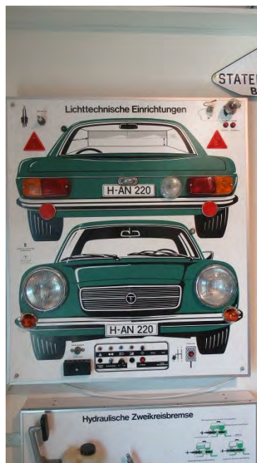
Lighting test board