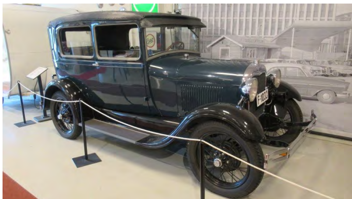
1928 Model A Ford