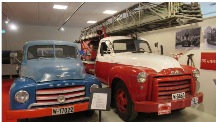
1954 Opel Blitz stake bed/tow truck, 1950 GMC ladder truck