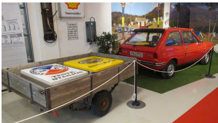
Circa 1980 Ford Fiesta and trailer