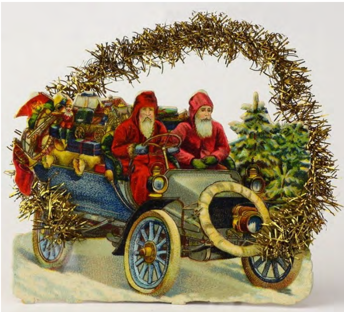
Circa 1902 embossed die cut card with attached tinsel for hanging on a Christmas tree from my collection. Printed in Germany.

These are real antique decorations featuring early automobiles. Some were home-made, others were commercially produced. They were all intended for display and not for play. They were delicate when produced and today, age generally has done them no favors. Those items that have survived often show some deterioration. When not displayed, they were usually stored in attics or basements with uncontrolled climates. The few that do survive were obviously treasured items appearing only for a brief period of time - in December.