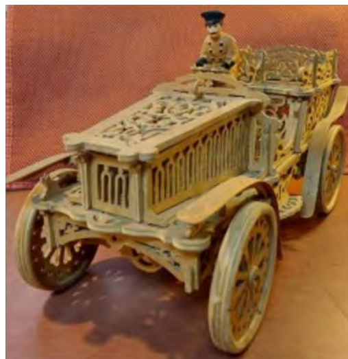
Another great Smokers Companion in the form of a circa 1905 Gordon Bennett race car with antique celluloid driver. This car has working steering.