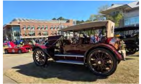
1911 Olds Limited.