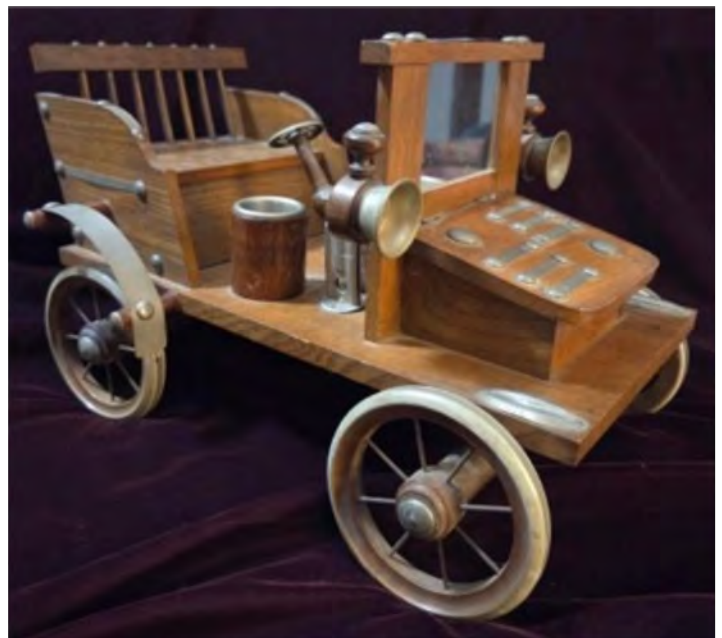
This is the only one I’ve seen with a glass windshield.

I’ve found several examples that serve as what’s known as a “Smoker’s Companion.” These desk-top items generally have hinged seats that reveal a storage compartment beneath for cigars or cigarettes. Lifting the hood reveals a compartment for matches. There is usually a place with a rough surface to strike matches on. Fancy versions have built in ash-trays and sometimes even cigar cutters.