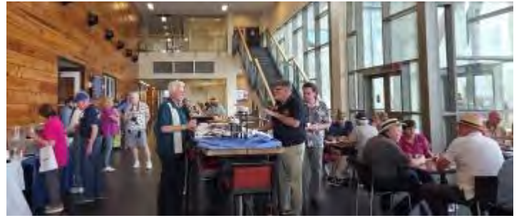
Friday evening social in the student center

The Savoy is a great place to visit, although it does not contain many early brass-age vehicles and not a lot of "memorabilia". The ever-changing displays make it interesting. The facility itself is absolutely first-class.