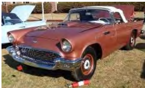
1956 T-bird F Series.