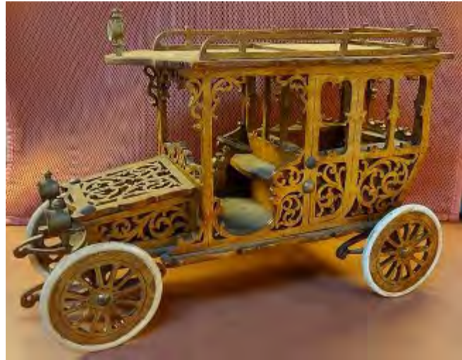
Scroll-cut Smokers Companion with brass lamps, rubber tires and opening doors. A hinged panel in the top provides access to the cigars in the back seat.