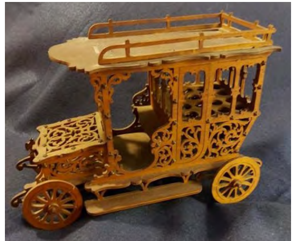
A similar example, likely produced by the same maker.

Other examples of wooden cars from my collection include these beautifully done and extremely delicate fretwork examples. The workmanship is amazing. The handwork is exquisite in the cut scroll-work on these. Some were cigar containers, and others held liquor decanters and shot-glasses. There is more definitive reference material available on these as they have been described as being produced in Germany in the 1905-09 time frame. Some examples include intricately made brass lamps and even rubber tires.