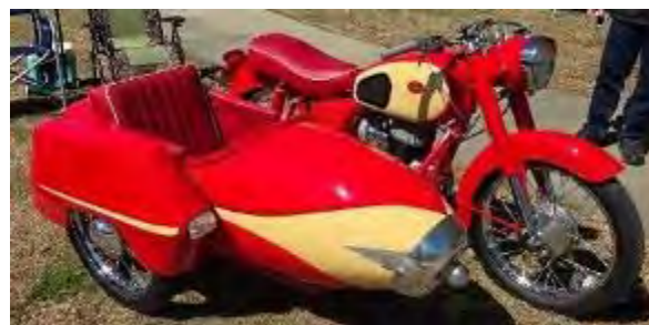
1968 Pannonia T5 with Duna Sidecar.