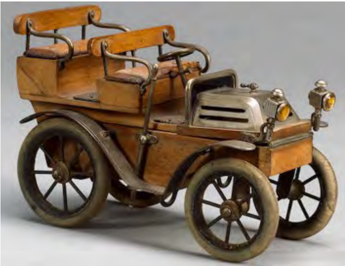
Ernst Plank Smokers Companion. Cigarettes are under the hinged seat section, while matches are under the lift-up front hood. Note the jeweled headlamps.

One of my favorites is this early 1900s writing set containing an inkwell under the seat, a compartment for postage stamps under the hood, and a small drawer for pen nibs and a sharpening knife. The steering wheel is actually a pencil holder.