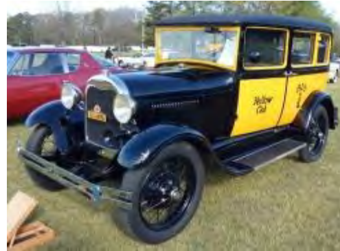
Model A taxi.