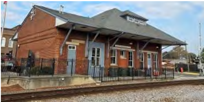
Train tracks divide the town.

and the world's oldest Coca-Cola sign brightly painted on the side of an ice-cream parlor.