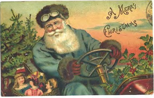
Part of a series, these two cards show Santa in a different pose wearing different colored clothing. Both were printed in England