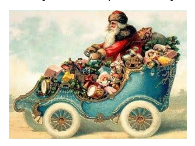
Printed in Germany, postmarked 1906

existing regulations needed revision. By 1907, the back was divided into two parts, one for the message, and the other half for the address. From this point on, postcards were known as "Divided Back."