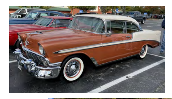
Square Car Tour