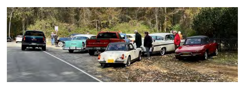
Square Car Tour