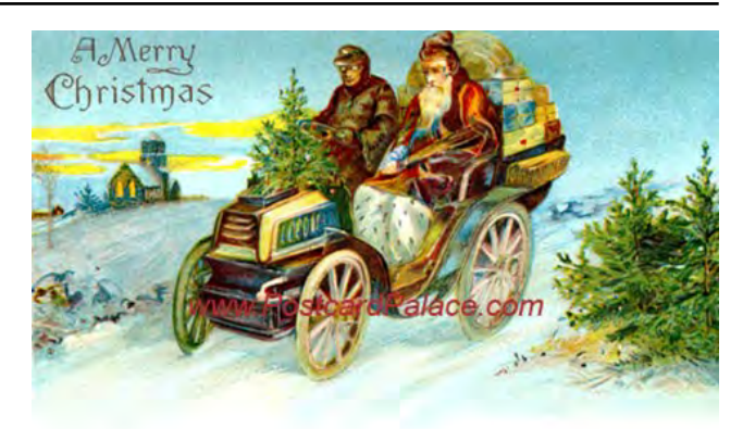
British made card, postmarked in 1904

From my collection of antique auto related postcards, there are numerous examples of how Santa "got modern" to speed up his deliveries.