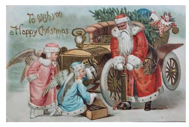
Santa has delayed his trip to repair a flat tire.

Even Santa was not immune to some of the problems facing early motorists as seen in this cute card of him repairing a flat tire, assisted by angels.