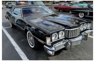
Meeting at Kroger parking lot

The tour lasted about 2.5 hours and totaled 56 miles. Many thanks to Richard Hall for setting up a great and very different drive!