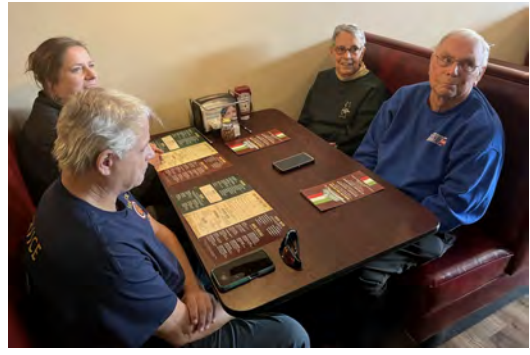
Late lunch at Little Italy