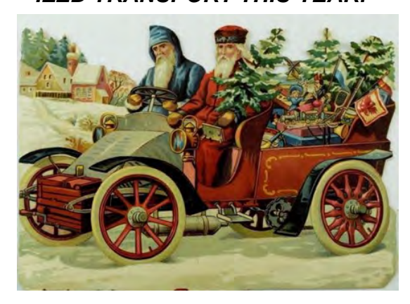
German made card, postmarked in 1903

FLASH ANNOUNCEMENT – SANTA HAS PARKED HIS SLEIGH IN FAVOR OF MOTOR-IZED TRANSPORT THIS YEAR!